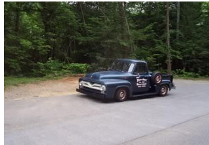
Picture I took on Gatlinburg Bypass one morning while at the 09 GSM Run

The 09 GSM F100 was a good one. I had a chance to get up early one morning and take cruise in and around Gatlinburg before the traffic got going good. I and some of the members from the F100 internet gang I keep up with took a picture over at Rick Allen's, Carolina Classic Tent. I am looking forward to this year's show.